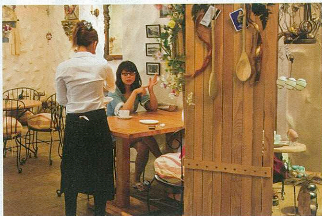
The Cream Pot serves breakfast and brunch from 6:30 a.m. to 2:30 p.m.